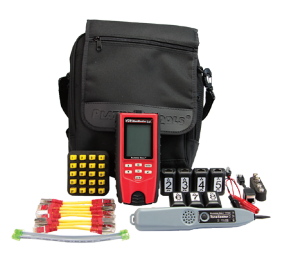
T130K3 VDV MapMaster 3.0 Deluxe PRO Kit