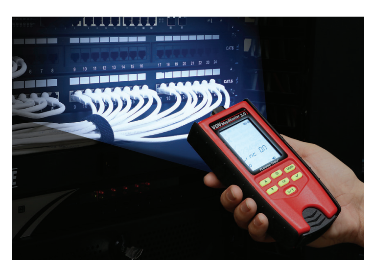
Easy to read, backlit LCD screen with large icons, glow-in-the-dark keypad and built-in LED flashlight for use in dark areas