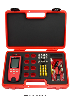
T130K4 Network & Coax Field Kit