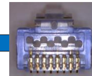
Standard RJ45 TIA568B