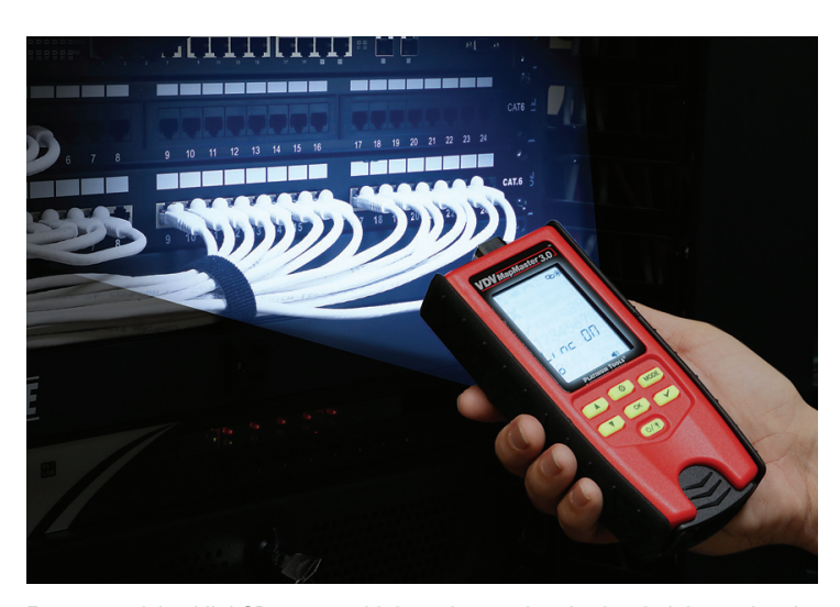
Easy to read, backlit LCD screen with large icons, glow-in-the-dark keypad and built-in LED flashlight for use in dark areas